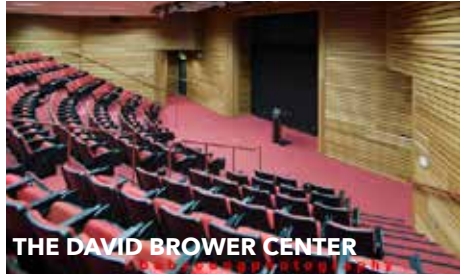
THE DAVID BROWER CENTER