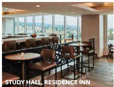
STUDY HALL, RESIDENCE INN