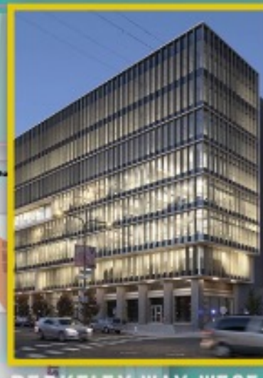
BERKELEY WAY WEST