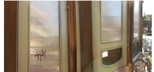
BART Rotunda Rose Project Before and After

We work closely with Berkeley PD and in some instances a tagger can be charged with a felony if proof can be shown of the damage/costs incurred. Please be aware of the taggers and if you see someone in action, please contact Berkeley PD and call the Ambassador Hotline at 510-550-7550.