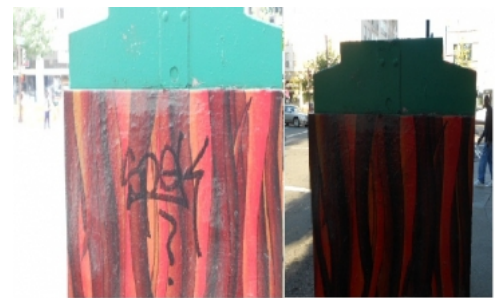
Earth Island Institute Utility Box Art Project Before and After