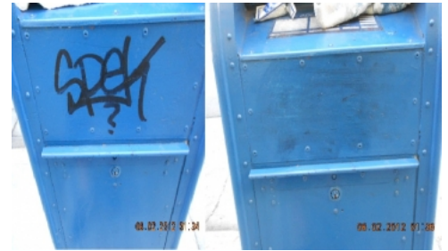
U.S. Postal Service Mailbox Before and After